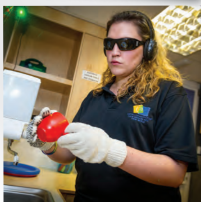
Book full the Virtual Dementia Tour