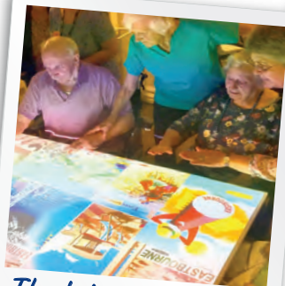
The latest products, innovations & services