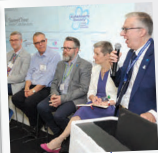
Expert speakers and Q&A sessions