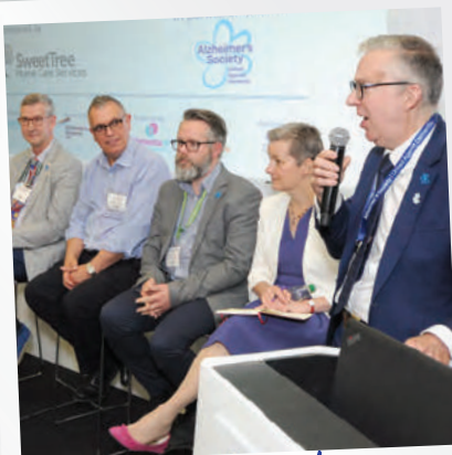
Expert speakers and Q&A sessions