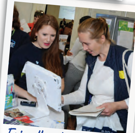
Friendly advice & professional networking

Visit The Alzheimer's Show 25-26 March at the Business Design Centre, London, the UK's leading exhibition and conference for dementia information, resources, help and advice and for the first time at any event, experience the full Virtual Dementia Tour.