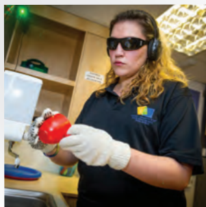
Virtual Dementia Tour